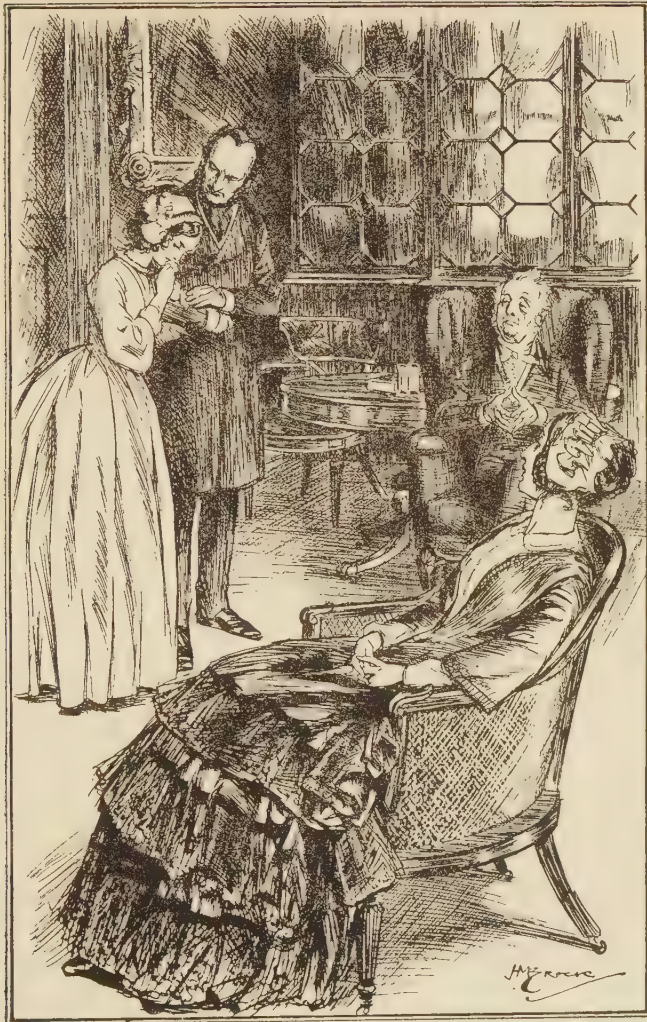
Rosa says Good-bye to Lady Dedlock